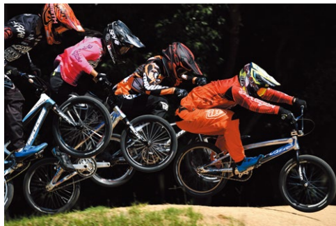
Focal Length: 300mm Exposure: F/8 1/500sec ISO: 200

Precise AF tracking and VC (Vibration Compensation) are essential to ultra-telephoto lens performance. Tamron's Dual MPU high-speed control system** helps make this possible. In addition to an MPU (micro-processing unit) with a built-in DSP for superior signal processing, the A035 features a separate MPU dedicated exclusively to vibration compensation. With AF tracking and enhanced VC, you can enjoy shooting fast-moving subjects with stability and ease—even in low-light.